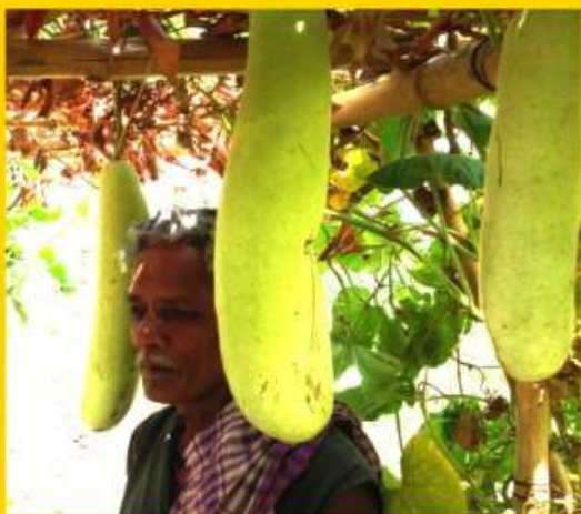
Training on home gardens :

Training programmes : The organization has conducted various trainings as recurring programmes with the support of the local administration and other NGOs in a self sponsored mode. The details of the trainings conducted are as follows :