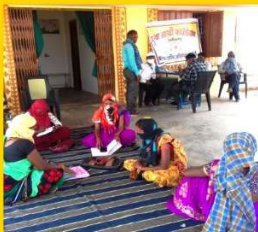
SHG training programme :

As a measure to improve the livelihood conditions of the farmers, Home garden initiatives were taken last year and it was continued this year as there was much time for the beneficiaries due to lockdown. There was a good response of vegetable cultivation in the home gardens at Sarguja, Surajpur, Kriya and Jahspur. More than 1500 home gardens were developed during the lockdown and more than 1000 families have registered their earnings through selling vegetables. They were linked with the benefits of government's Baadi programme. Some of them have even cultivated medicinal herbs in their garden. The programme has given very good results. This helped the farmers to have additional income to their families.